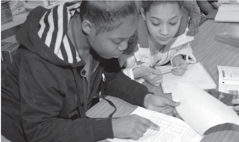
homework buddies at work